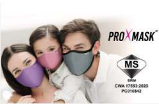
Prolexus's ProXmask™ Antiviral Mask Is the First Certified Reusable Mask by SIRIM