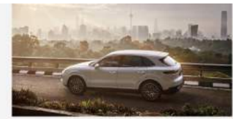
The Sports Car For Your Family