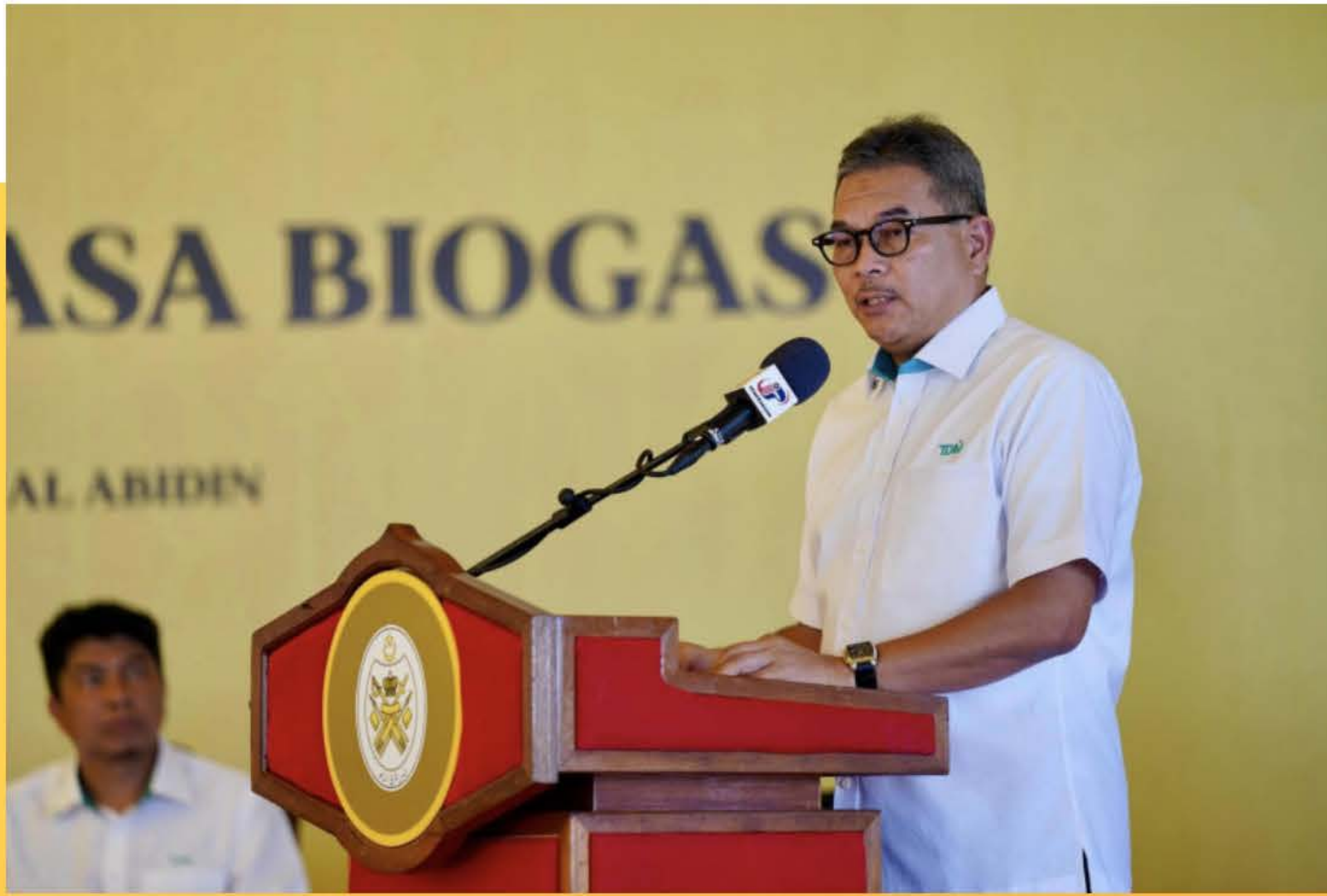
Datuk Tengku Farok Hussin Tengku Abdul Jalil (right) says that the plants have the potential to generate 29.78 million kilowatt hours of renewable energy per annum using the covered lagoon system at Kemaman and Sg Tong. – TDM Berhad Facebook pic, May 28, 2023

Updated 1 day ago · Published on 28 May 2023 6:06PM