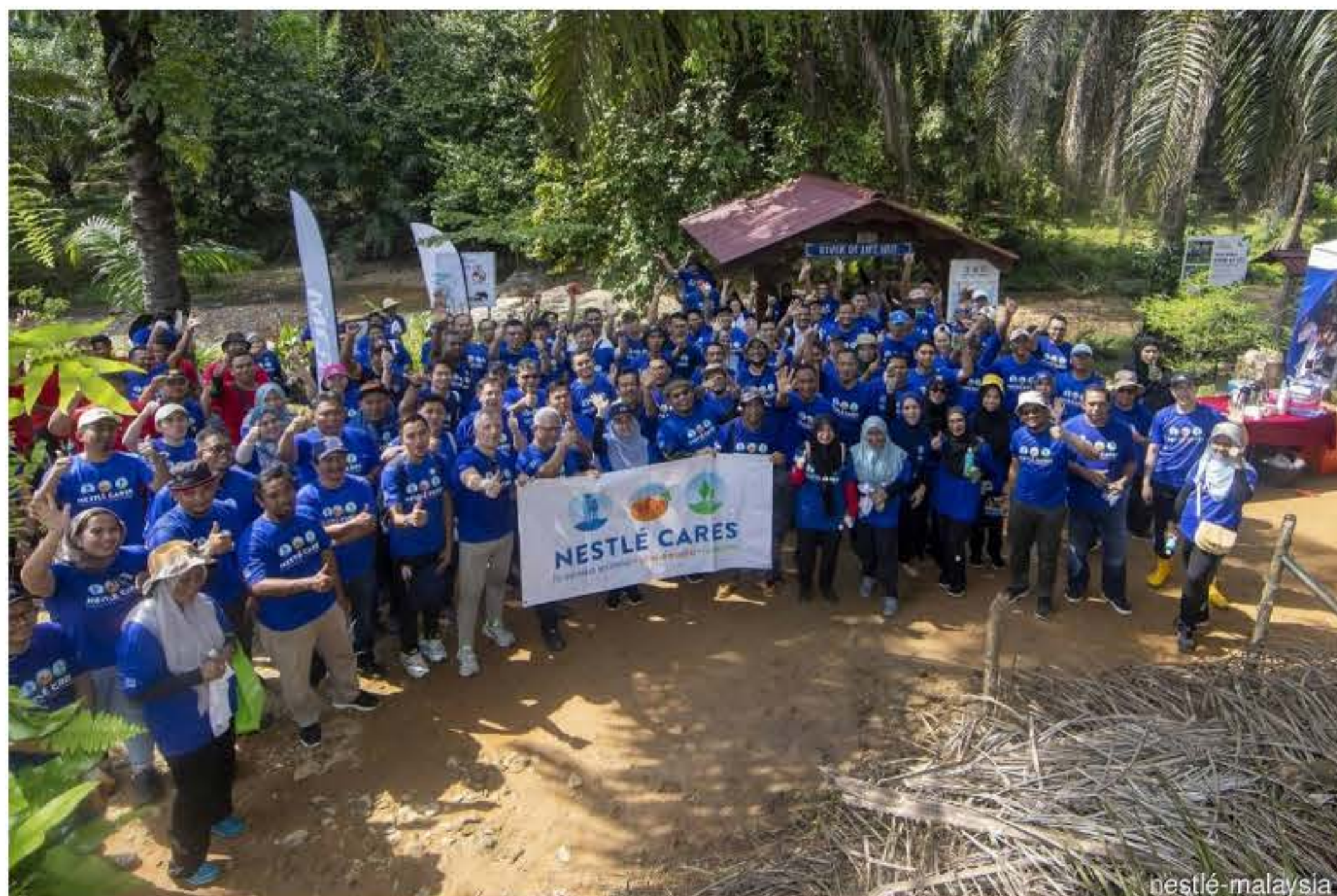
Nestlé Cares volunteers demonstrating their green thumbs at the tree planting event at TDMP's Jernih Estate.

Publish date: Thu, 22 Jun 2023, 08:47 AM