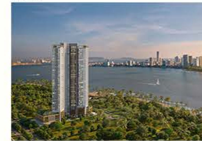
Arica on Andaman - Desirable development elevates all life stages